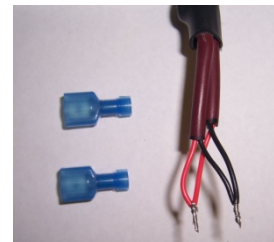
Item 4 & 5