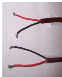
Item 2 & 3